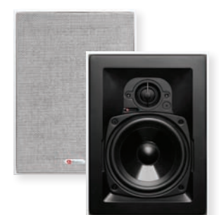
HSi 455 2-Way 5¼" In-Wall Speaker